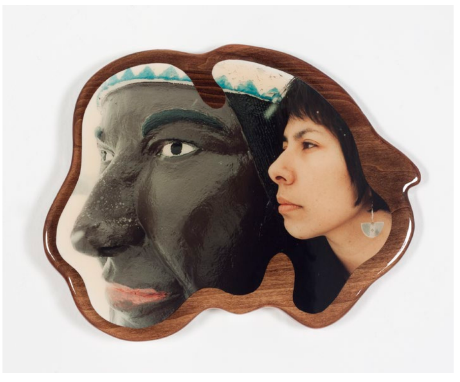
Rebecca Belmore, detail, Five Sisters, 1995. Photographic prints mounted on wood, dimensions vary. Collection of the Blackwood Gallery.

type photos popular in the twentieth century.<sup>15</sup> Wanda Nanibush recounts that many Indigenous homes, including her own, had these "wood-slice" images, which featured stereotypical "Indians" (e.g., an "Indian maiden").<sup>16</sup> Belmore retains the form of these photos but replaces the mythological "Indian" with a contemporary Indigenous woman, in locations that potentially challenge even as they allude to stereotypical representations. In one, Belmore crouches beneath a taxidermy moose. In another, her profile appears alongside that of a dark-skinned statue, as though inviting comparisons.